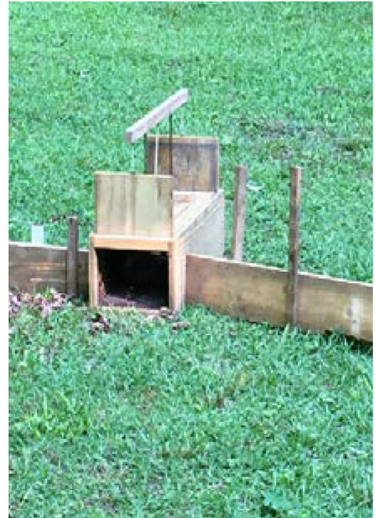
Figure 1: Diagram of the unbaited trap with wings used to capture nine-banded armadillos in South Georgia, summer 2004. Wings were constructed of pressure-treated lumber (2" x 6" x 6').

Given that capture success was quite low, it is unlikely that trapping is an effective method of quickly reducing local armadillo populations. Until an effective attractant can be found, lethal removal by shooting remains the most effective solution. If live-trapping and relocation are chosen as control measures, however, the use of any of the attractants tested is unnecessary. Armadillos in this study were just as likely to enter a baited trap as an unbaited trap. It is likely that the armadillos we did capture randomly walked into the traps and were not necessarily attracted.